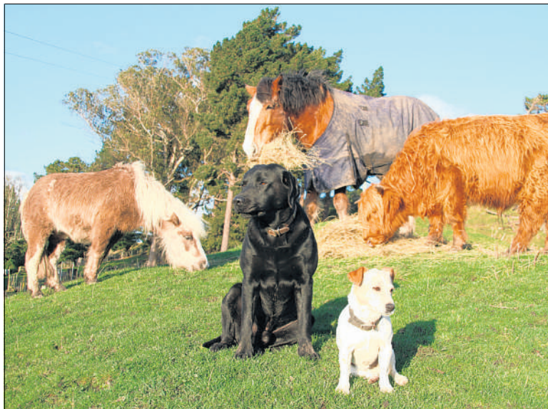
FARM LIVING: Friendly animals to feed in the paddock.

"We realised that what, to us, was ordinary would be extraordinary for visitors."